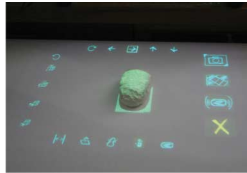
Figure 6. SketchSpace tracks and projects a texture on a roughly sculpted mouse made of modeling clay. The icons on the top, left and bottom correspond to virtual sensors. The icons on the right are for displaying images and adding or removing virtual buttons. In counter clockwise from the 'is below icon' (down arrow): is above, is right of, is left of, is rotated right, is rotated left, is tilted up, is tilted down, is tilted left, is tilted right, is near, is higher than, is deformed (measured as the distance changed in curvature features), is grasped (measured in amount of hand pixels obscuring the object) and button tapped.

When sketching an organic design, and by that we mean a rough and early-stage exploration of a potential design, not unlike an architect's sketch of a building, we argue that interaction should be decoupled from its material embodiment. Computational materials should be mimicked as interactive behaviors, ones effortlessly imbued in a physical prototype. This carefully removes the material challenges of designing OUIs and makes it easier to sketch them.