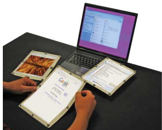
Figure 2. PaperWindows explores a set of interaction techniques for digital paper interfaces.

Although these non-planar interfaces explore aspects of organic design, their ideation and iteration inevitably hinged