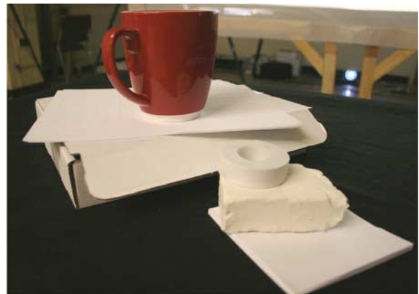
Figure 7. A designer can work with a range of materials using SketchSpace. This includes everyday objects (cup, paper, box), deformable surfaces (CD cover, tape) and malleable material (modeling clay).

To imbue interactive behaviors in a passive physical prototype this way, SketchSpace imbues passive prototypes with input sensing using Microsoft's Kinect camera. Mathematically analyzing the depth sensing using techniques from computational and differential geometry allows SketchSpace to infer a broad set of inputs, ranging from touch events on the object's surface and surrounding workspace, orientation, position, motion, proximity and, among others, shape deformations (see Figures 6 and 7). A designer uses these inputs to prototype as if it had functionality, including mapping sensor values to interactions using embodied gestures and projecting dynamic interactive content