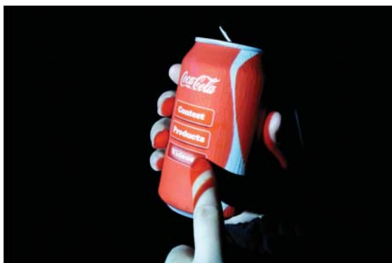
Figure 1. The DynaCan is a pop-can computer that embodies a cylindrical interactive display and demonstrates an application in mass consumerism.

We begin this section with an observation that the current methodologies of user interface design, much like the characters in Abbot's Flatland (Abbot, 1884), are inherently limited by their flat dimensionality. After having built, researched and evaluated a broad set of objects with both simulated and functioning curved interactive displays skins, from a dynamic pop-can (see Figure 1) (Akaoka and Vertegaal, 2010), to a paper window (Holman et al. , 2005), to a paper phone (Lahey et al. , 2011), it is evident that these non-planar forms lead to interface characteristics that are contingent on their unique shape. In