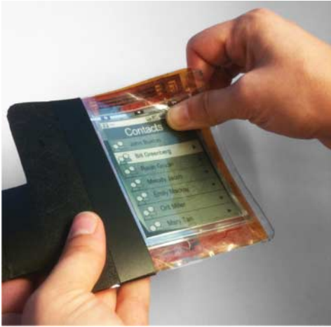
Figure 3. PaperPhone is an interactive flexible paper computer that uses bending as a way of navigating.

on a fully functioning prototype (one that required a significant investment in both time and materials to construct). To support designers better, we must update our design tools to answer the challenge of seamlessly prototyping interactive organic systems. PaperPhone 's flexible backplane, on which its bend sensors were soldered, required custom-etched circuitry that took, at a minimum, 2–3 days to construct. In early iterations, the thickness of the copper sheet and layout of the circuit patterned negatively affected the ergonomic of a user's hand position, requiring lengthy iterations. Unifying the challenges of industrial and interface design this way, in the form of an flexible circuit backplane, typifies the basic challenge of working with early organic design: shape adds a layer of complexity to exploring interaction design, one that makes designing for and sensing interactions on even simple interfaces, like PaperPhone 's bending interaction, incredibly difficult. Similar arguments can be made for Gummi , Illuminating Clay or any other fully functioning organic hardware device.