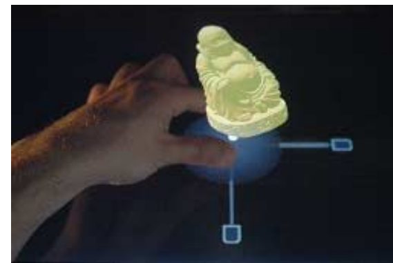
Figure 1: Example screenshots of multi-touch interaction in the context of 3D stereoscopic display: (left) A 3D medical visualization is displayed on a vertical stereoscopic screen so that it appears to the user to “float” in the air above the table. Interaction is performed by touching its “shadow” on the multi-touch table. (right) A user interacting by means of simple 2D gestures on a monoscopic touchscreen, while visualizing occlusion-free 3D stereoscopic objects floating above the surface at an optically correct distance.

manual interaction with 2D data has been studied extensively [5], it is still not clear how to use these input concepts for complex 3D data.