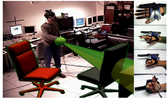
Figure 1. An AR user interacting through gesture, speech and SenseShapes . The tracked glove and three possible gestures are shown at the right.

SenseShapes are volumetric primitives (spheres, cubes, cylinders, and cones) that we attach to the user (e.g., a pointing cone attached to the hand). Previous work in AR and VR has included selection of objects using rays or